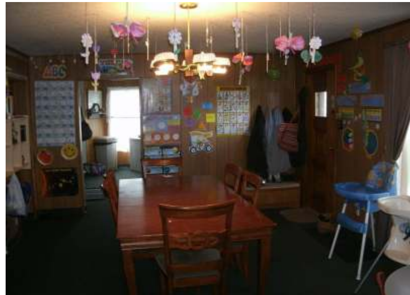
Type B in East Liverpool