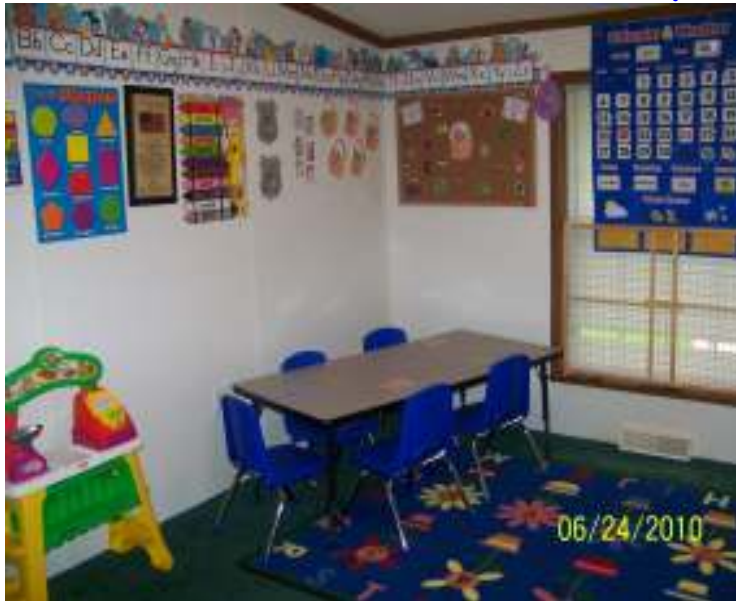
Type B in East Liverpool