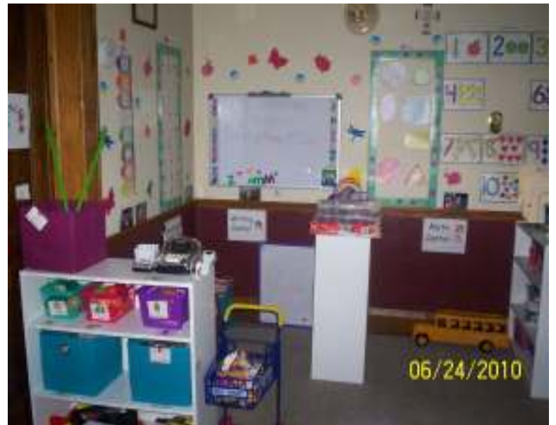
Type B in Salem