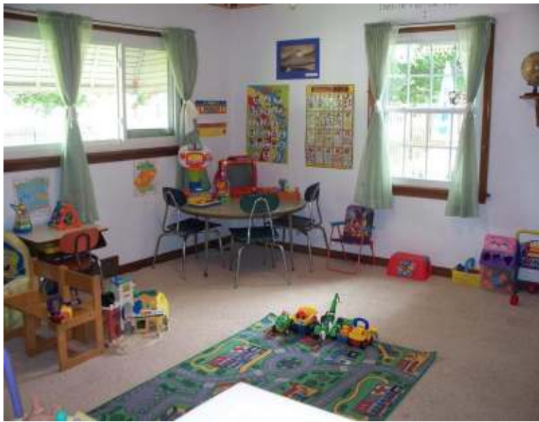
Type B in East Palestine