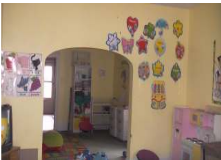
Type B in Wellsville