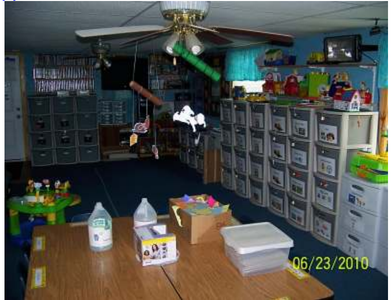
Type B in East Liverpool