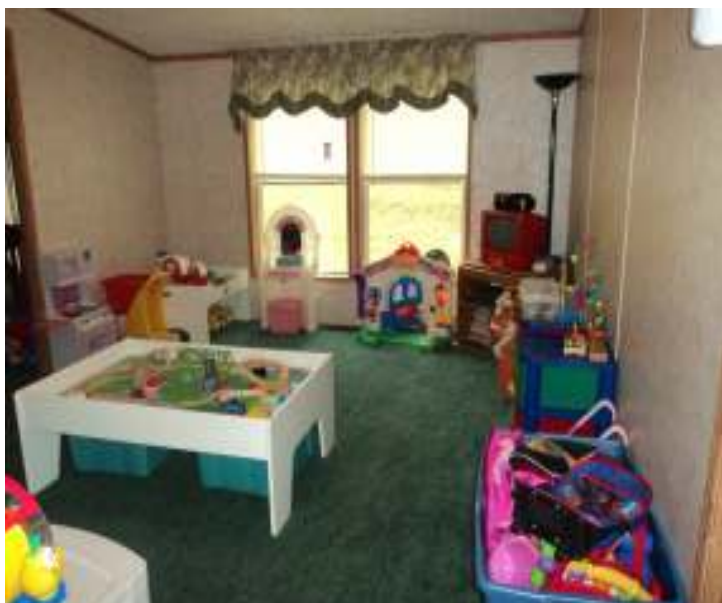
Type B in Lisbon