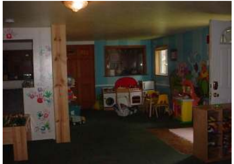
Type B in Salem