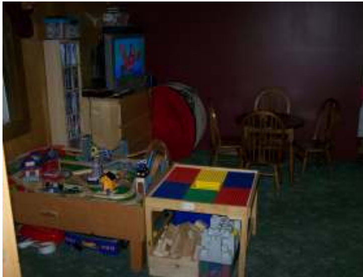
Type B in Leetonia