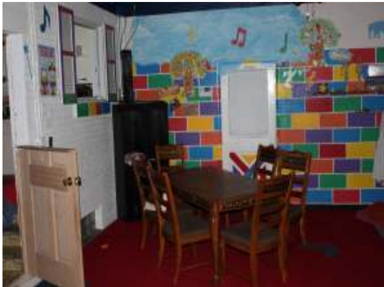
Type B in Salem