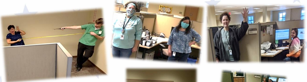
employees remaining in the agency practiced social distancing