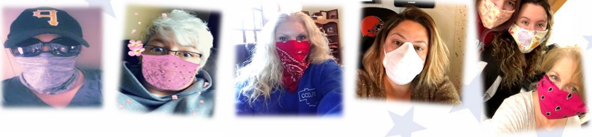
During COVID-19, approximately 40% of employees teleworked