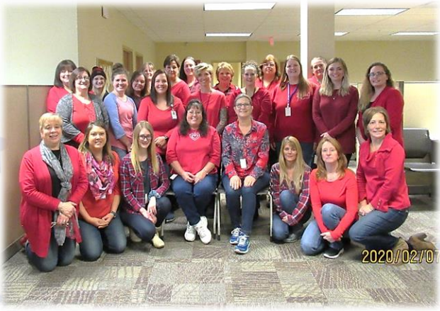
Heart Health Awareness Month: February (before COVID-19 social distancing)

Agency activities were very limited in 2020 due to the COVID-19 Pandemic