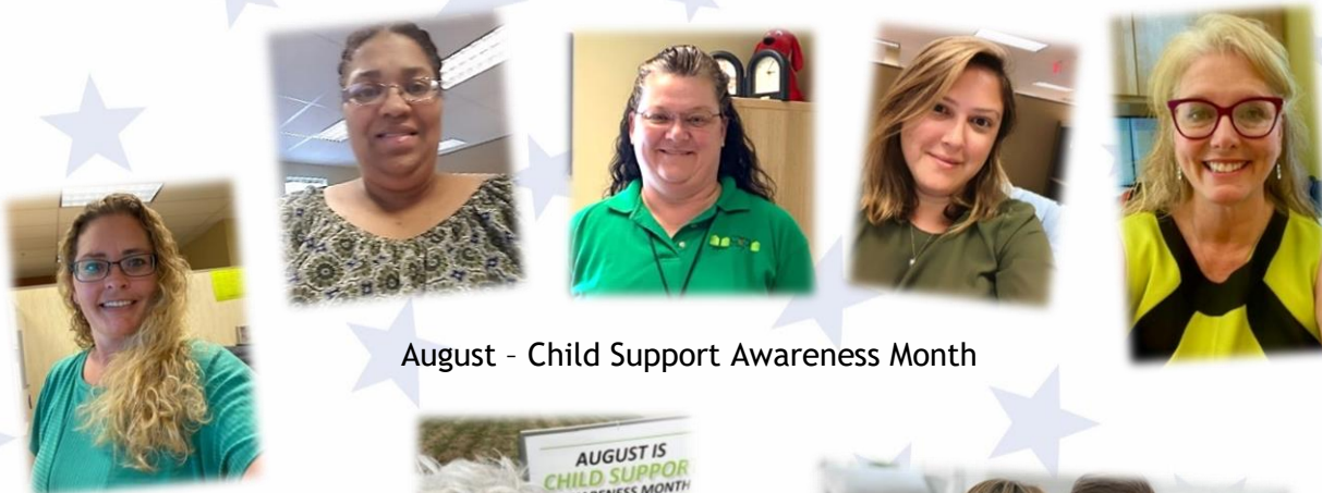
August - Child Support Awareness Month